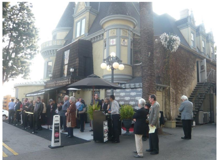
Waiting for the Valet