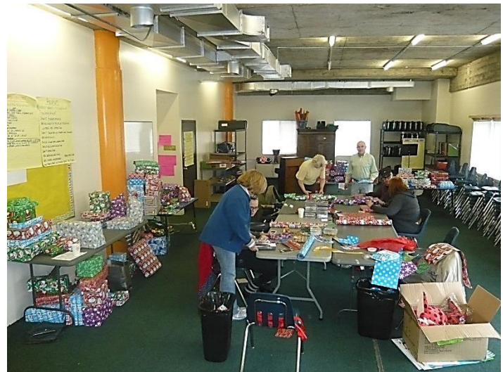
COPW Volunteer elves wrapping away.