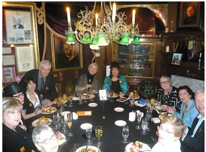
COPW members enjoying lunch