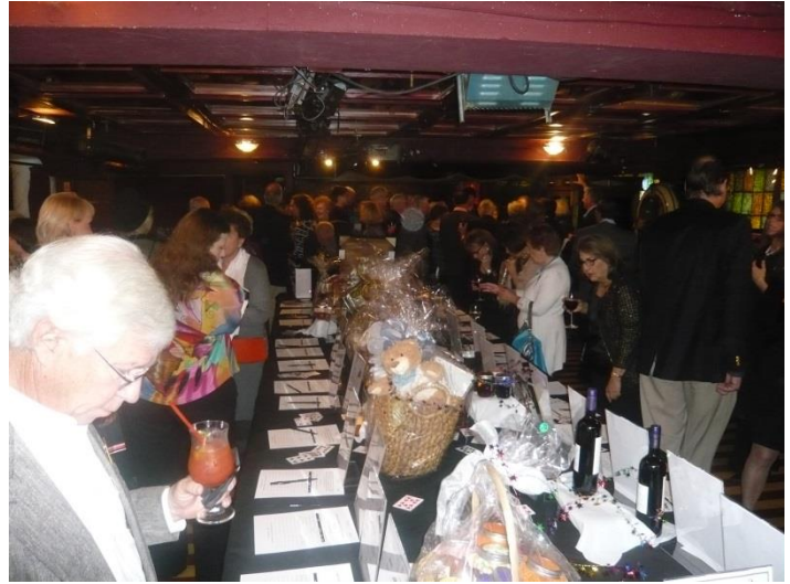
Tough choices at the silent auction